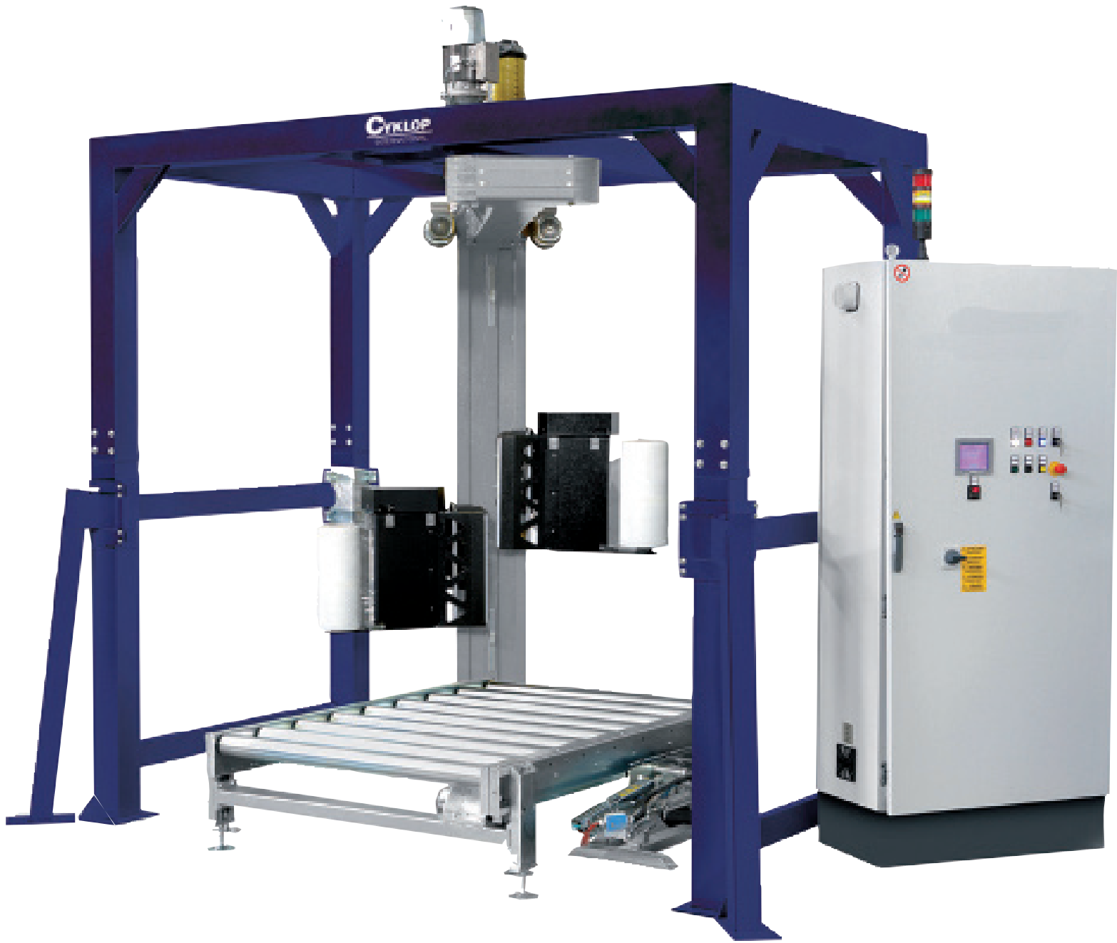
STRETCH WRAPPER MODEL: CSA TWIN